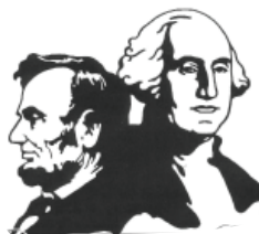
Presidents Day February 16 th