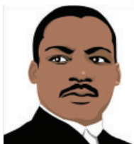
Martin Luther King, Jr. Day January 19 th