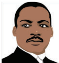
Martin Luther King, Jr. Day January 20 th