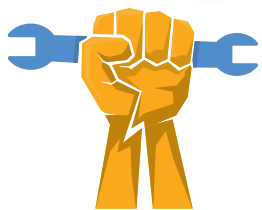
Labor Day September 6 th