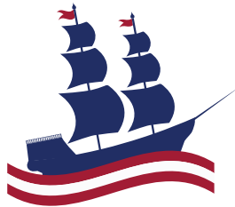
Columbus Day October 12 th