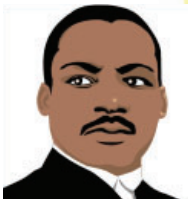
Martin Luther King, Jr. Day January 21 st