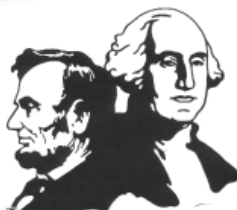
President's Day February 18 th