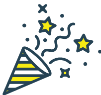
New Year's Day January 1st 2019