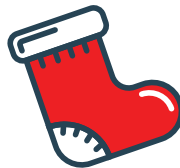
Christmas Eve December 24th (Close at 1:00pm)