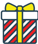
Christmas Day December 25th