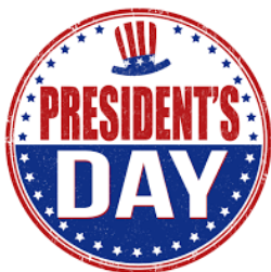
Presidents' Day February 19th