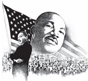
Martin Luther King, Jr. Day January 15th