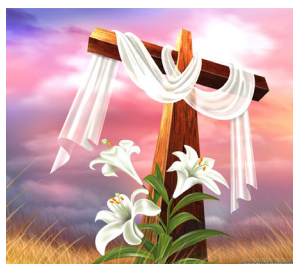
Good Friday March 30th