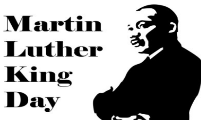
Martin Luther King, Jr. Day January 16, 2017