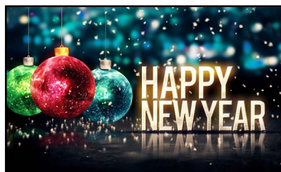
New Years January 2, 2017