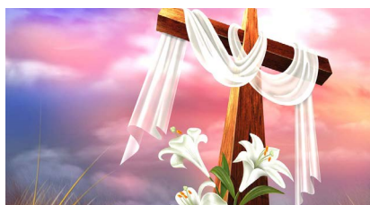
Good Friday April 14, 2017