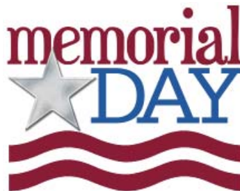
Memorial Day May 30th