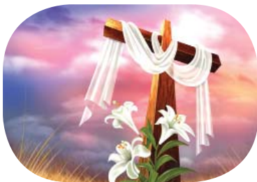
Good Friday March 25th